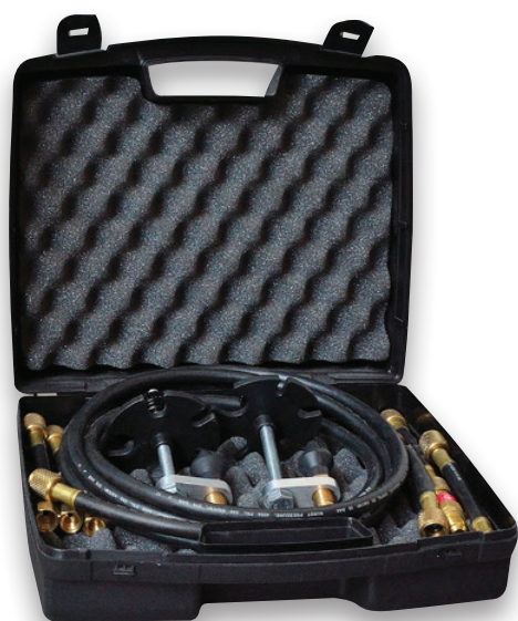
Optional Flushing Kit*