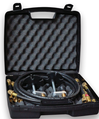
Optional Flushing Kit*

A refrigerant identifier is now also available to be added to this unit. The identifier is controlled by the AC station itself and will not allow contaminated refrigerant or other non-approved refrigerants to be recovered. If a contaminant is detected the identifier will automatically stop the service.