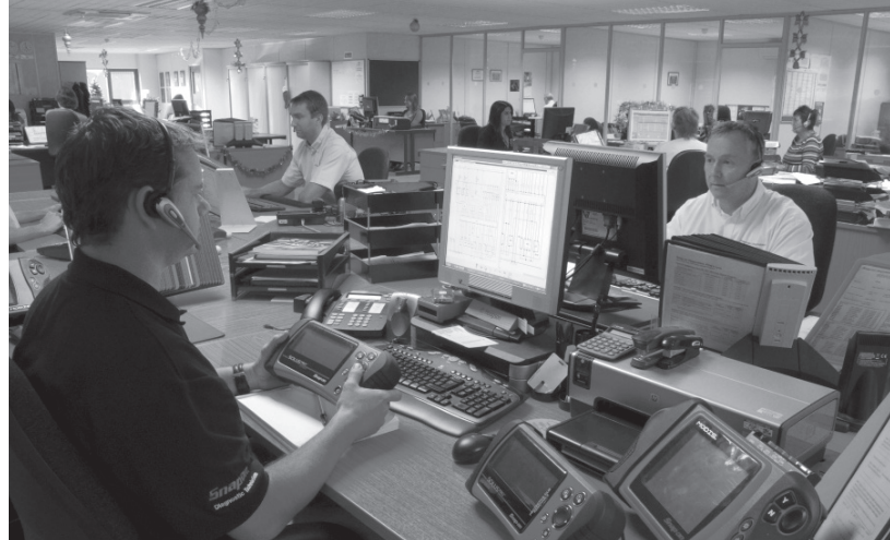
UK call centre

The KoolKare range will deliver one of the most profitable, productive solutions in the modern workshop, giving the workshop owner a quick return on their investment.