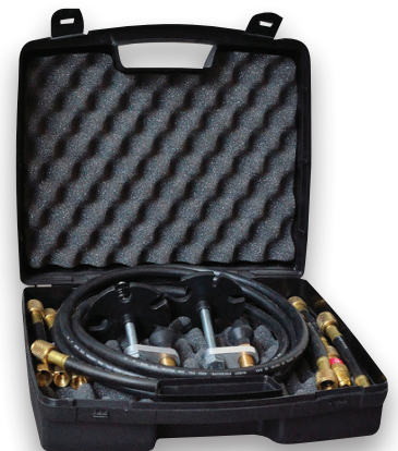
Optional Flushing Kit*