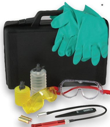
Optional Accessory Kit