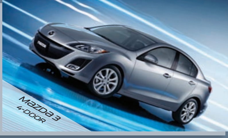
The MAZDA 3 has exceeded the expectations of nearly two million owners around the world and is by far the best-selling vehicle in the Mazda lineup—one in every three Mazdas sold worldwide is a MAZDA 3.