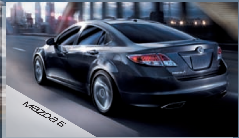
The MAZDA 6 is a mid-size sedan that doesn't behave like one. It offers all the standards in its class like four-door, five-passenger seating, interior roominess, comfort and convenience features and lots of cargo space. However, the MAZDA 6 goes one step further by adding style, performance, technology and passion.

CX-7 is a highly styled crossover SUV with a decided soul of a sports car. Produced entirely on Mazda-derived platform architecture, the five passenger CX-7 embodies an astute blend of sports car verve and SUV practicality, resulting in a fun-to-drive SUV that represents everything a Mazda should be.