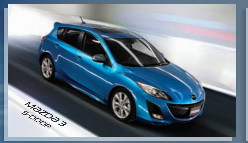
The MAZDA 3 5-Door offers the versatility you need, with all the bells and whistles you demand. Offering standard and optional equipment simply not found on other cars in its class.

Head-turning design and pulse-racing performance come in many shapes and sizes. From the highly styled CX-7 to the very versatile MAZDA 3. And, of course, the envy-inducing Mazda RX-8. Why not see for yourself? Better yet, drive for yourself. You'll find every Mazda brilliantly engineered and totally fun to drive. After all, Zoom-Zoom comes standard on every single one.