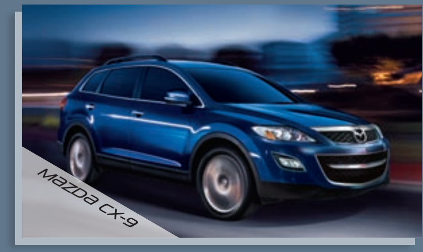
Mazda's CX-9 is one of the most award-winning vehicles in the automotive industry. Skillfully blending sporty driving spirit with seven-passenger SUV practicality. The CX-9 is powered by a 273-horsepower 3.7-liter V6 engine and features standard Roll Stability Control and an available advanced Blind Spot Monitoring (BSM) System, which helps see and prevent the unexpected.

*Always check your mirrors and be aware of the traffic around you.